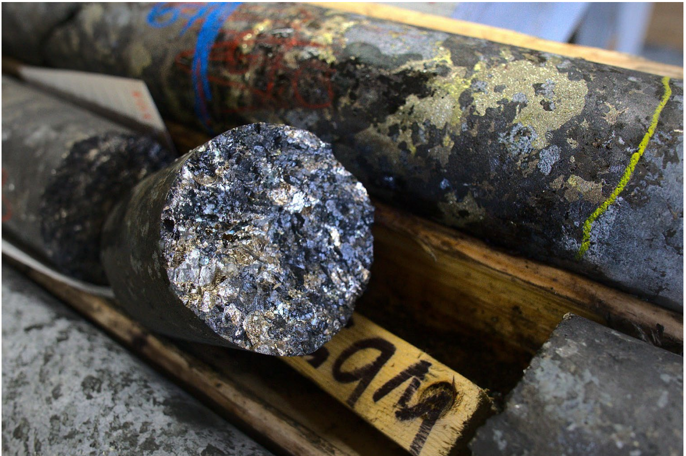
Figure 1. Core picture from Chamber South DDH-22-01

Vancouver, BC, September 13, 2022 – Go Metals Corp. (“Go Metals” and/or the “Company”) (CSE: GOCO ) is pleased to announce nickel and copper sulfides have been visually identified at all five zones from the first ever drilling at the 100% owned HSP Nickel-Copper PGE Project, Quebec, Canada (the “Property”). The program has completed 1,250 metres of drilling to date and initial samples have been sent for analysis at an independent laboratory to be assayed for nickel, copper, platinum, and palladium content.