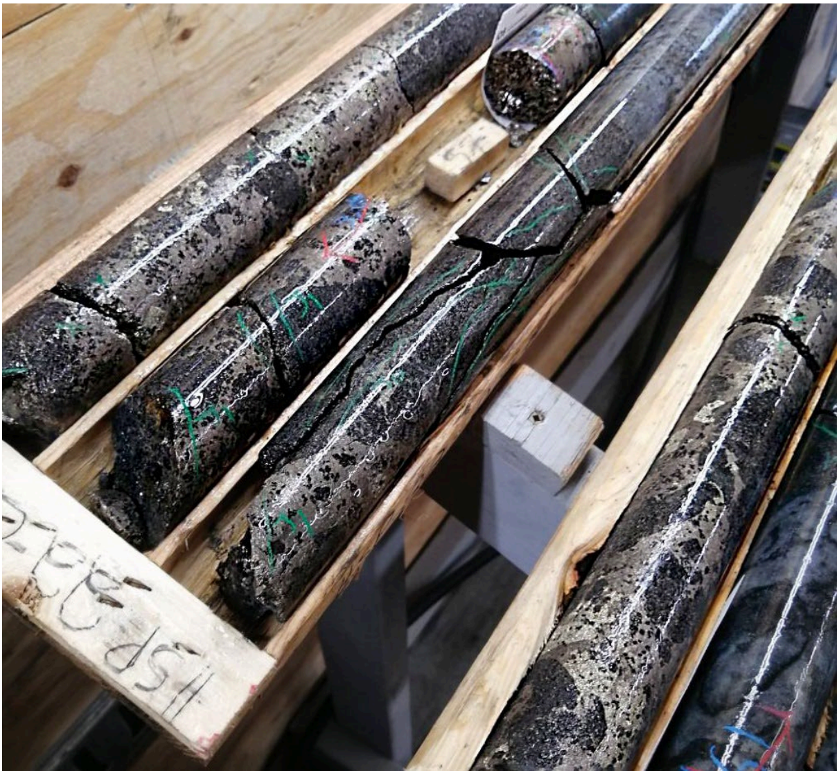
Figure 3. Core picture from PGE Central DDH-22-08

The mineralized system is interpreted to remain open along strike and at depth. The company believes the presence of nickel-copper bearing sulphides at depth under all the largest EM anomalies warrants significantly more drilling.